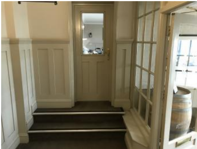
Gallery Entrance 1