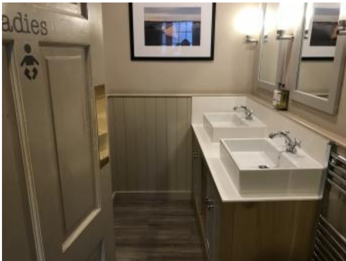
Female Toilet Interior