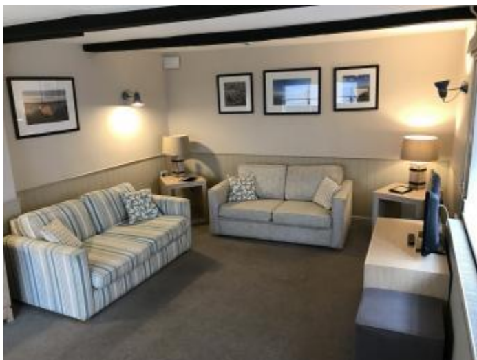
Ground Floor Room Lounge 1