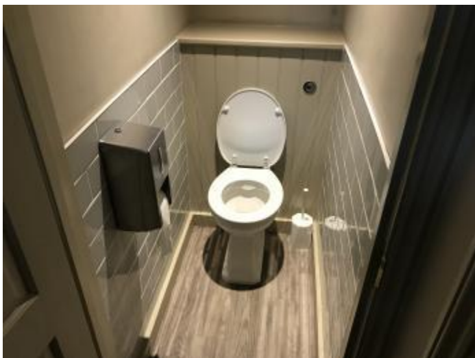
Male Toilet Cubicle