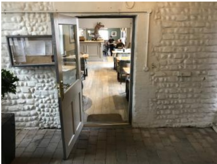
Alternative Entrance At Rear