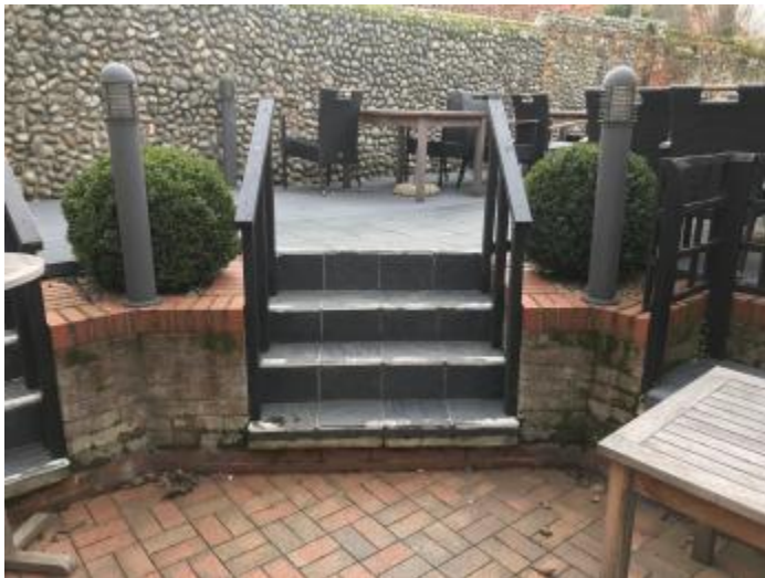
Steps To Terrace