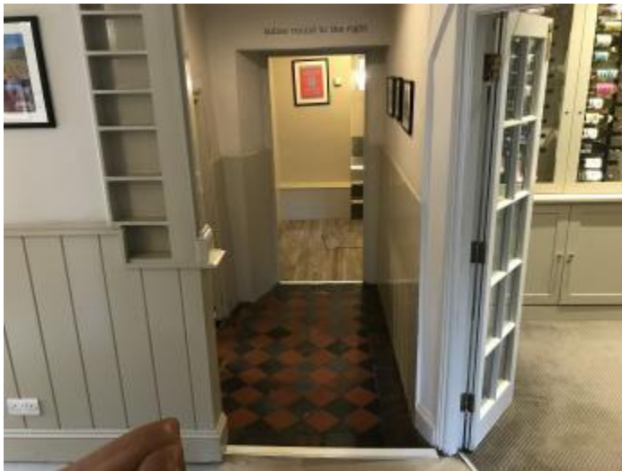
Route To Female Toilet