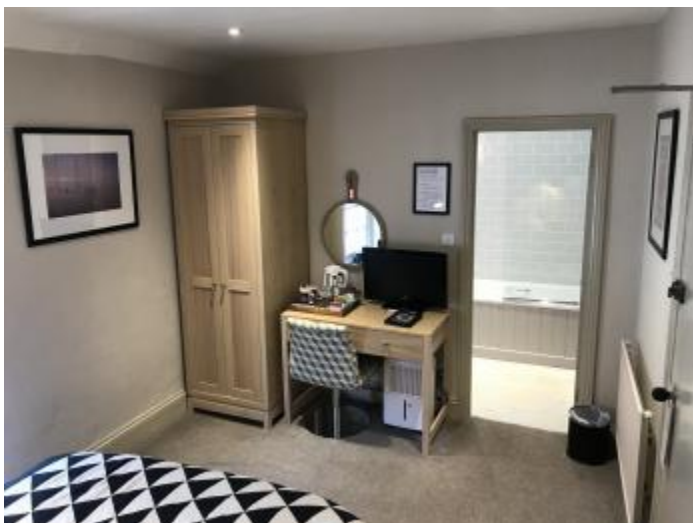
First Floor Bedroom Example 2