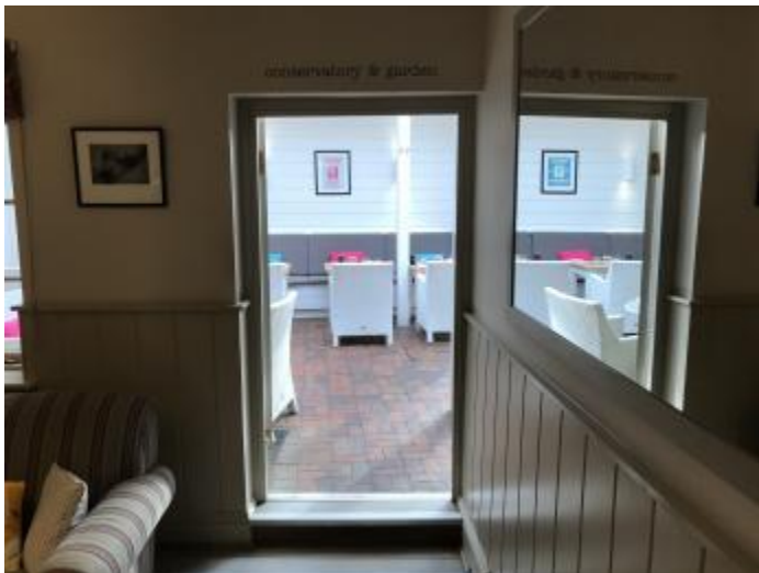
Entrance To Conservatory