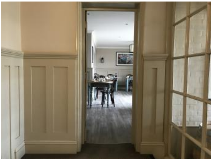
Gallery Entrance 2