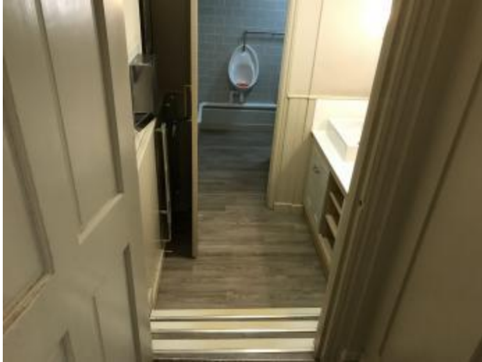
Male Toilet Steps