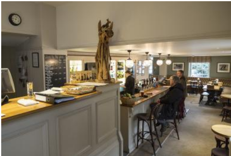
Bottom Bar 1