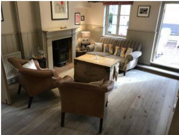
Route To Conservatory