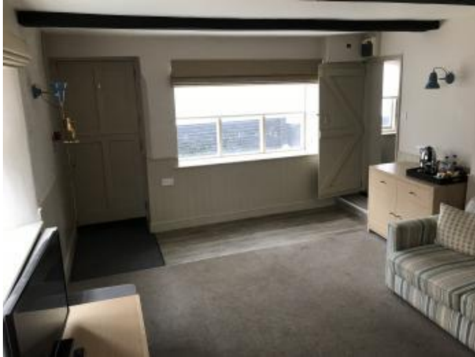
Ground Floor Room Lounge 2