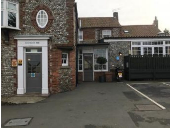
Car Park To Main Entrance