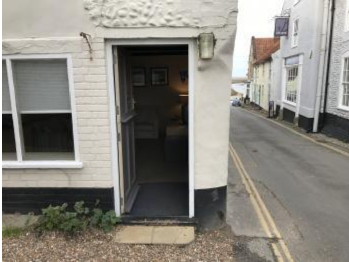
Door To Ground Floor Room