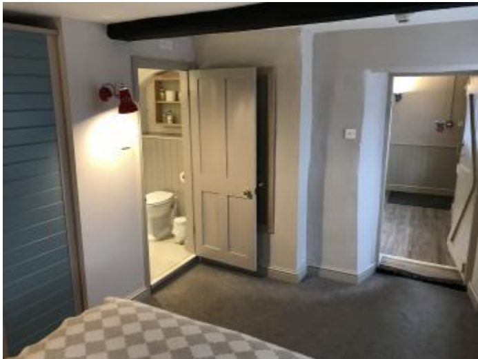
Ground Floor Bedroom 3