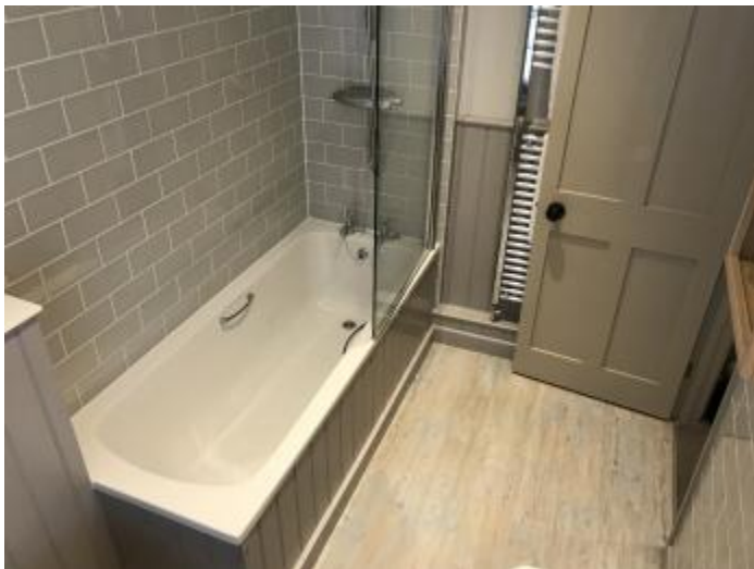
First Floor Bedroom Example 1