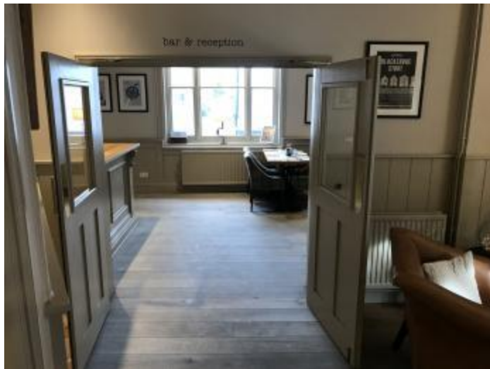
Top Bar Entrance 1