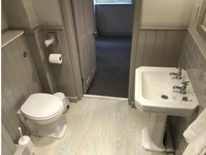
Ground Floor Bathroom 2