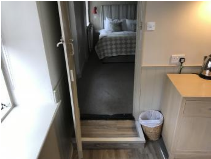
Entrance to Bedroom/Bathroom Area