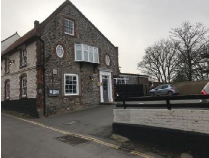
Car Park Entrance