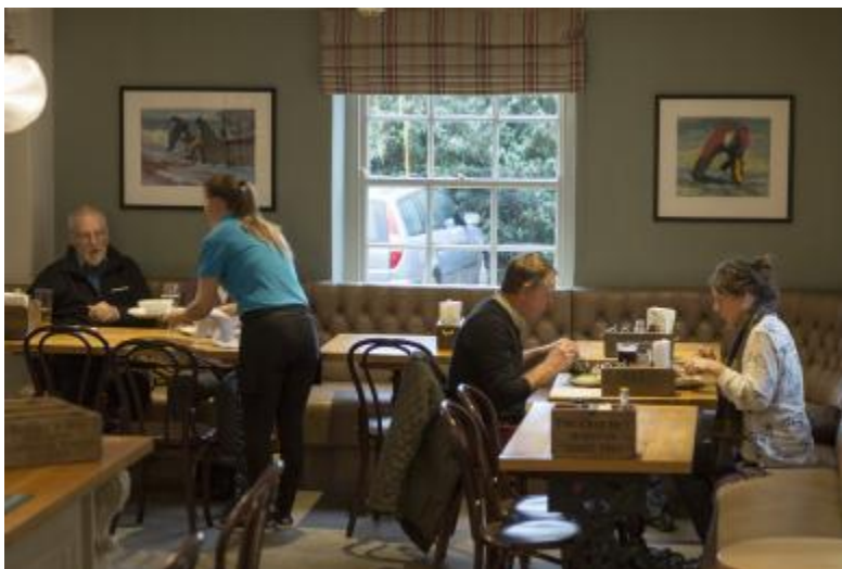
Bottom Bar 2