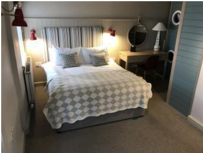
Ground Floor Bedroom 1