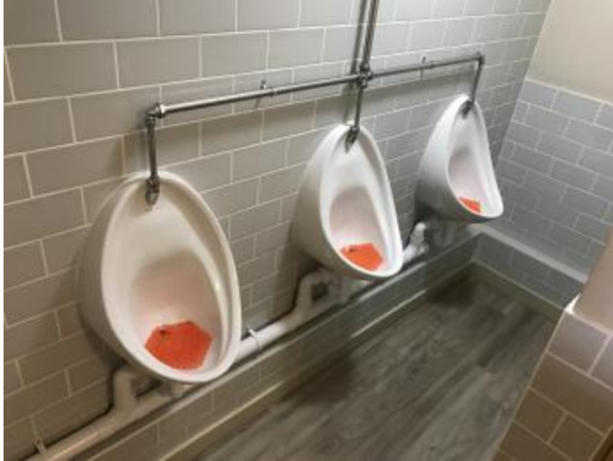
Male Toilet Urinals