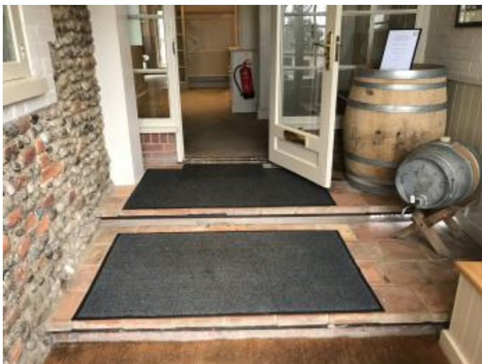
Main Entrance Steps