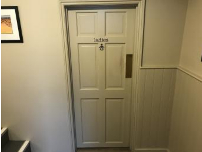
Female Toilet Entrance