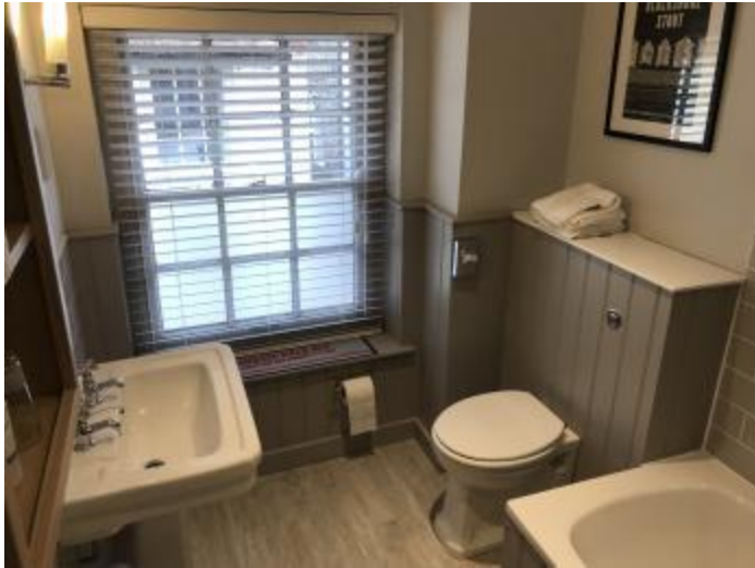
First Floor Bathroom Example 1