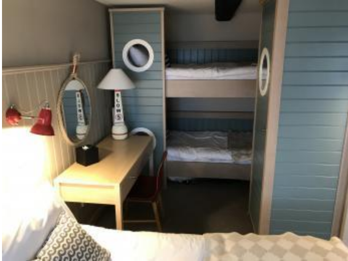
Ground Floor Bedroom 2