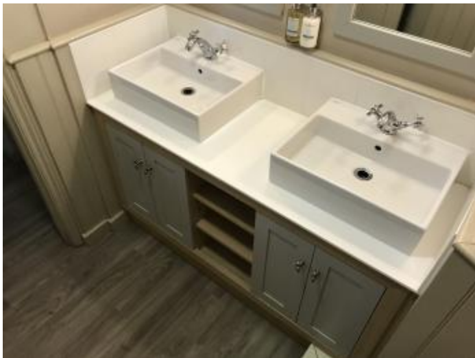
Male Toilet Sinks