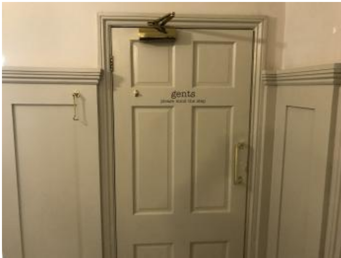
Male Toilet Entrance