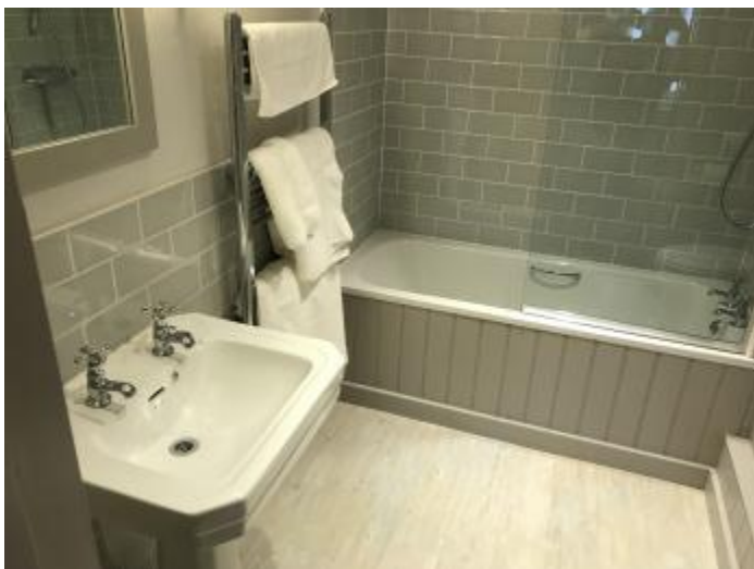
Ground Floor Bathroom 1