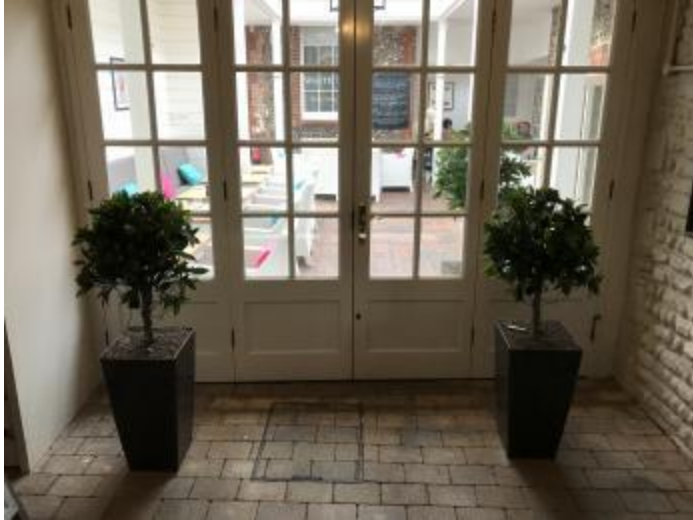
Alternative Entrance To Conservatory