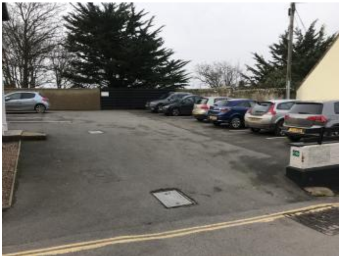
Car Park Entrance 2